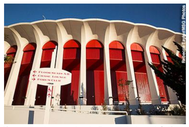
After an extensive renovation, the Forum, in Inglewood, California, is reopening as a music and entertainment venue. The exterior was restored to its original sunset red color.

The canopy was rehabilitated to prevent water intake, and the columns, which had seen a lot of spalling and paint deterioration, were recoated and refinished to let the concrete breathe yet still resist future water penetration. The metal siding was cleaned to remove the rust and then recoated. The building was repainted from blue to its original sunset red. The parking lot was also stripped down and repaved.