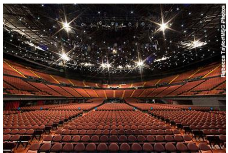
The Forum's 17,500 seats were replaced with new seating—the project's architect likened the experience to stepping into an arena-sized opera hall.

First, the 404 ft diameter record required 250,000 sq ft of printed vinyl, which even included grooves and shadows at its perimeter to more closely resemble a real record. The letters on the center label of the record—The Eagles' Hotel California, commemorating the famous Los Angeles band that would play at the Forum's reopening—were as tall as the Hollywood sign. Printing the vinyl record required eight days, nonstop.